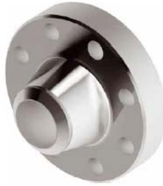
Flange for welding