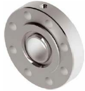
Flange for tools